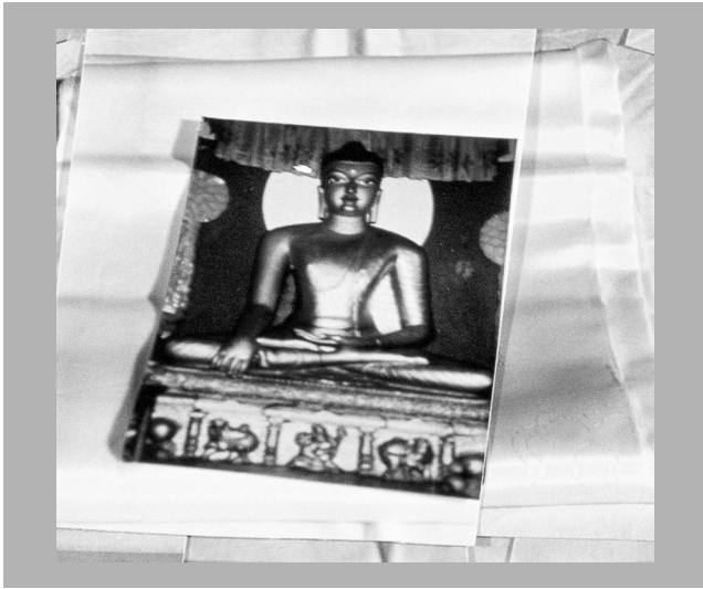
Picture of Shakyamuni Statue at Bodhgaya

“This is a photo of the Buddha Shakyamuni statue of Bodhgaya. Since some time ago, I’ve always kept it with me and consider this as the witness about my activities – including my motivation as a Buddhist monk – as a follower of Buddha.”